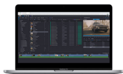
AVID NEXIS | EDGE WEB CLIENT (VIA CHROME)