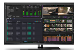
MEDIA COMPOSER | DISTRIBUTED PROCESSING