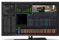
MEDIA COMPOSER | ENTERPRISE