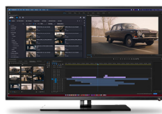
ADOBE PREMIERE PRO